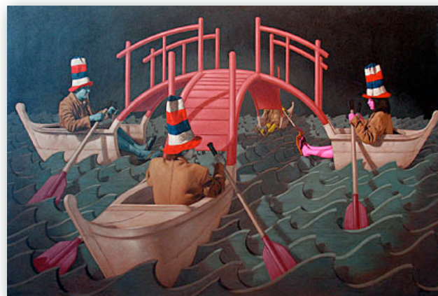
Modus Operandi by Alfredo Esquillo

One argument in favor of civil society engagement is that the G20 is an innovation in global governance. While it is not representative, the G20 has strategic importance due to the size of the economies and populations it represents. In this sense, it is more representative than the G8 and also perhaps more important in terms of the current balance of power worldwide.