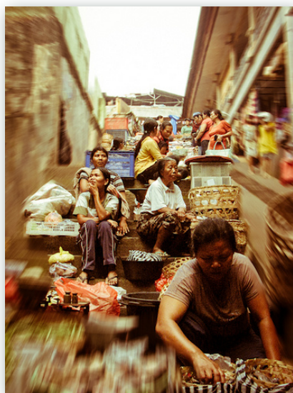
CC: BY-NC (yesy belajar memotrek)

domestic production, building food stocks, and food quality. In cooperation with the World Food Program, the Government is developing a map of food vulnerability in one province, which will be replicated in other provinces. Food security is also an issue for the governments in ASEAN which – together with three partner countries (China, Japan and Korea) – are establishing an ASEAN Rice Reserve Fund to ensure adequate production and food stocks and conduct research on rice varieties and climate resistant seeds. 6