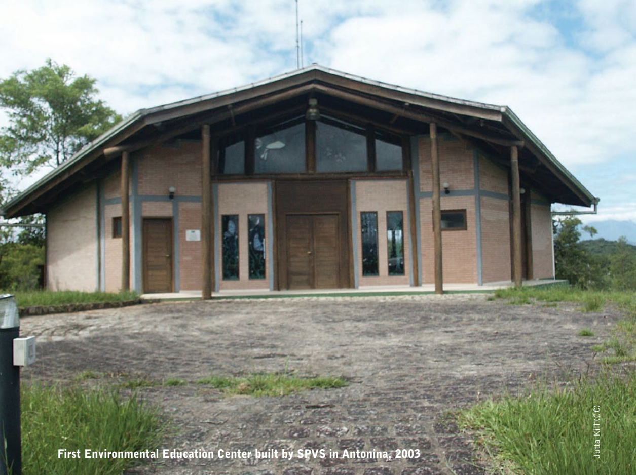
First Environmental Education Center built by SPVS in Antonina, 2003