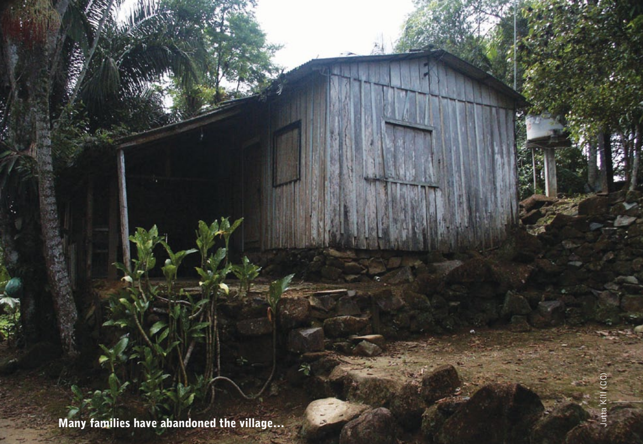
Many families have abandoned the village...