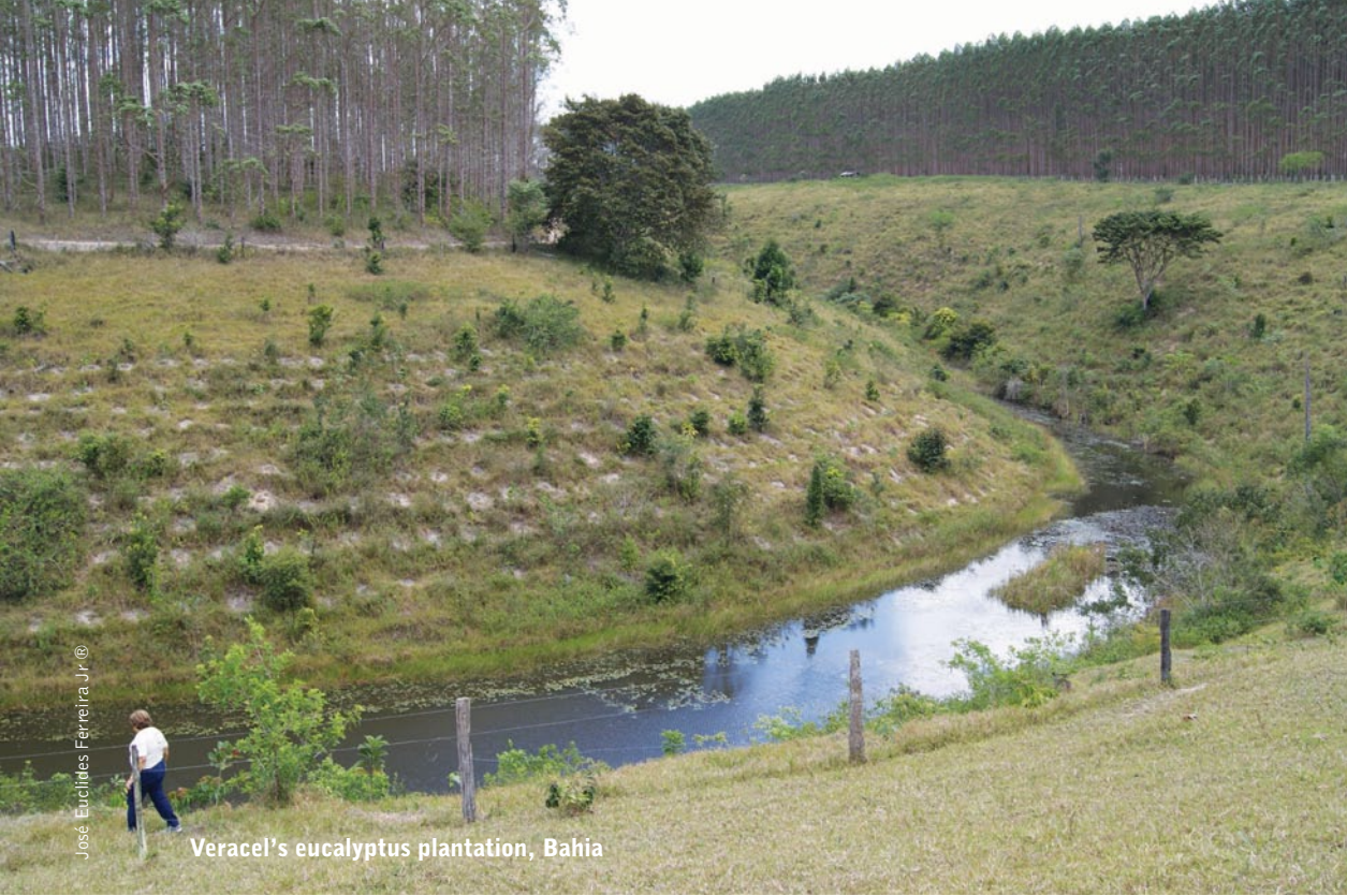
Veracel's eucalyptus plantation, Bahia