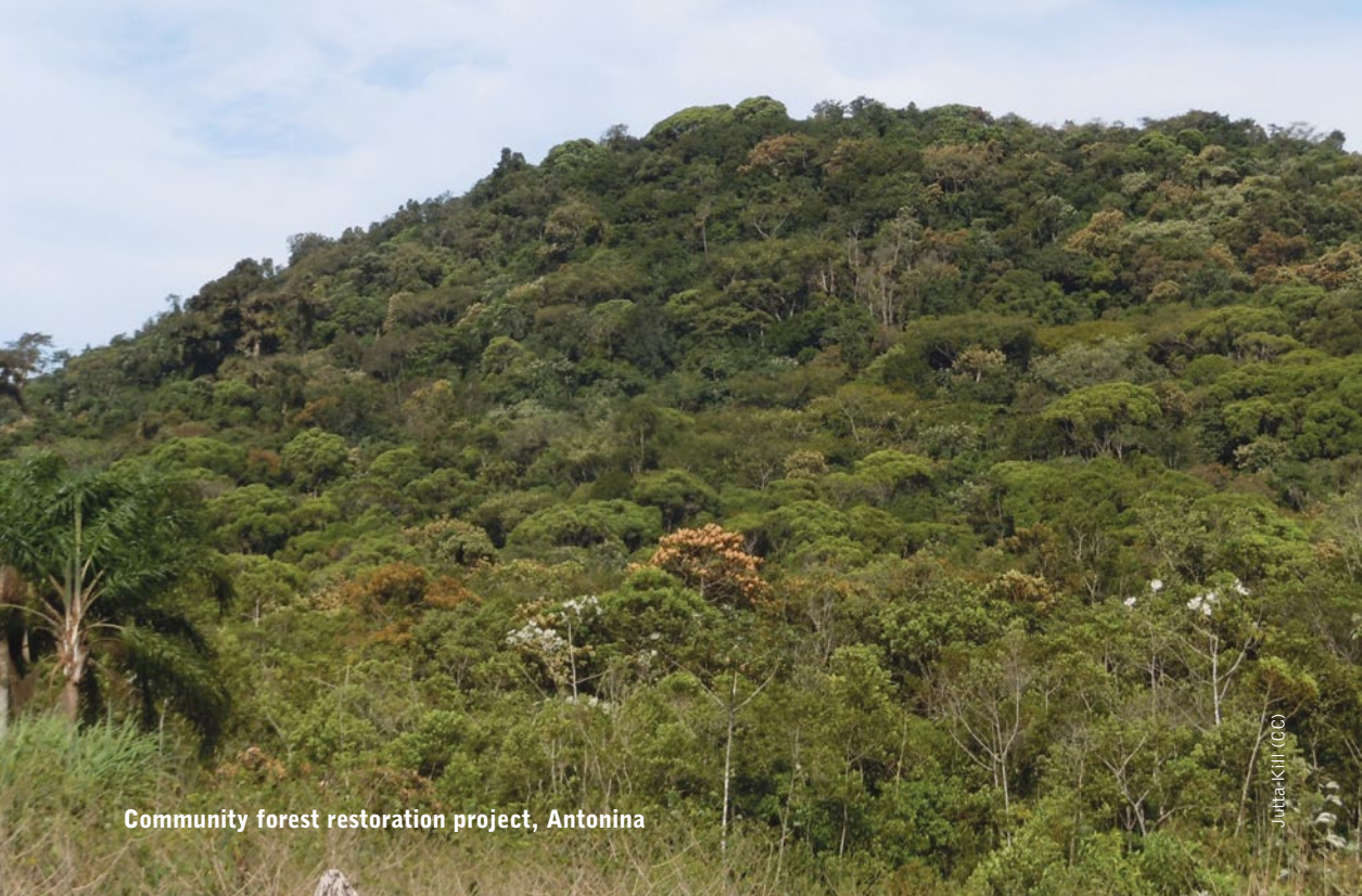
Community forest restoration project, Antonina