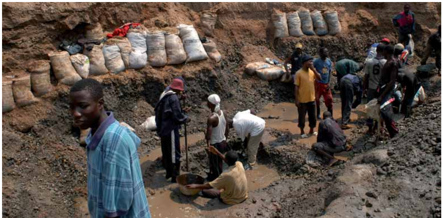
Diamond Mining near Mbuji-Mayi, Democratic Republic of Congo, 2003