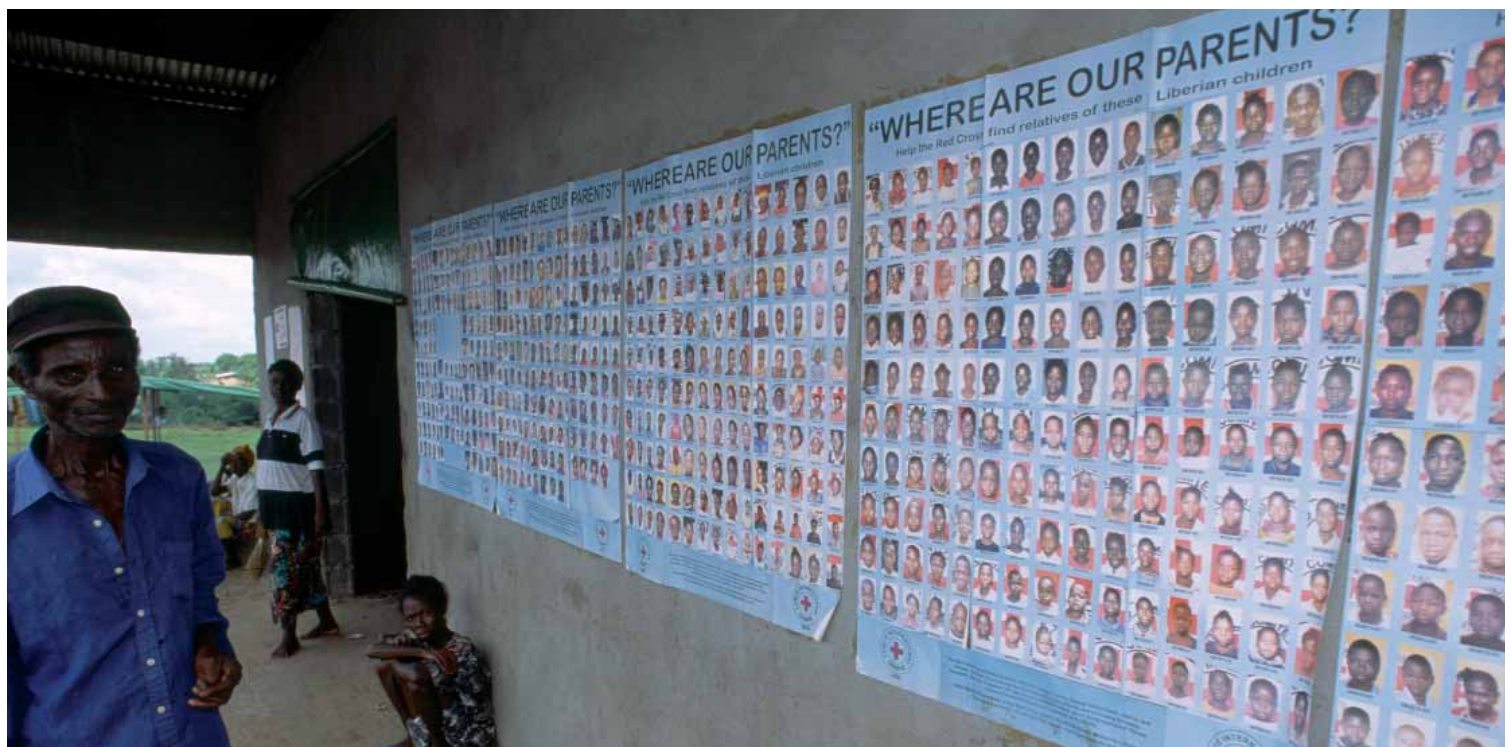
Red Cross tracing posters of Liberian children whose parents are missing

Neither the Voluntary Principles nor certification schemes of single commodities will provide a consistent answer of the international community to the problem of conflict resource.