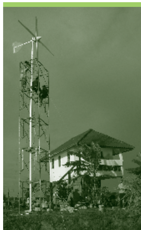
by Natee Sritong

The Heinrich Böll Foundation promotes a sustainable energy policy based on social and gender justice and responsive to our joint climate change responsibility. We believe that a multi-level approach bringing together various key actors and new policies for the generation of renewable energies is crucial for the energy future of Thailand and the Southeast Asian region.