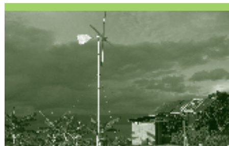
by Natee Sritong

With our Democratization Program we intend to make a strategic contribution to participatory democracy and strong citizenship in Thailand, Cambodia and Myanmar/Burma by enhancing civil society initiatives, gender democracy and information democracy.