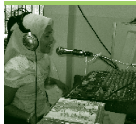
by Sarod Wellmanee

In 2007, Thailand was listed as one of the "top 10 backsliders" in the global press freedom and the country also takes a backseat (135 of 169) in the 2008 ranking of the Annual Worldwide Press Freedom Index. Reasons for such bad ratings are the numerous legal provisions restricting the access to independent information and allowing the government to censor contents that are "dangerous, immoral or insulting the monarchy" or restrictions in the name of national security. Especially internet providers and users have been affected, while the mainstream media has been practicing self-censorship for years. The recent closure of several community radio stations and websites have further contributed to the country's negative media image.