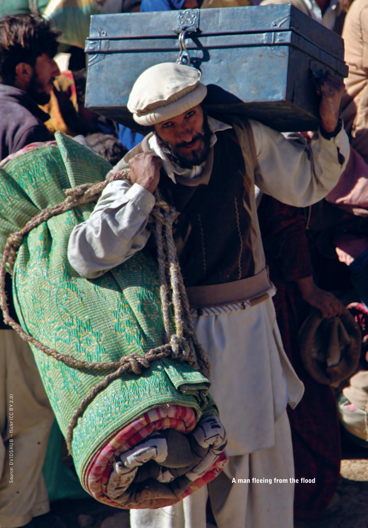
A man fleeing from the flood