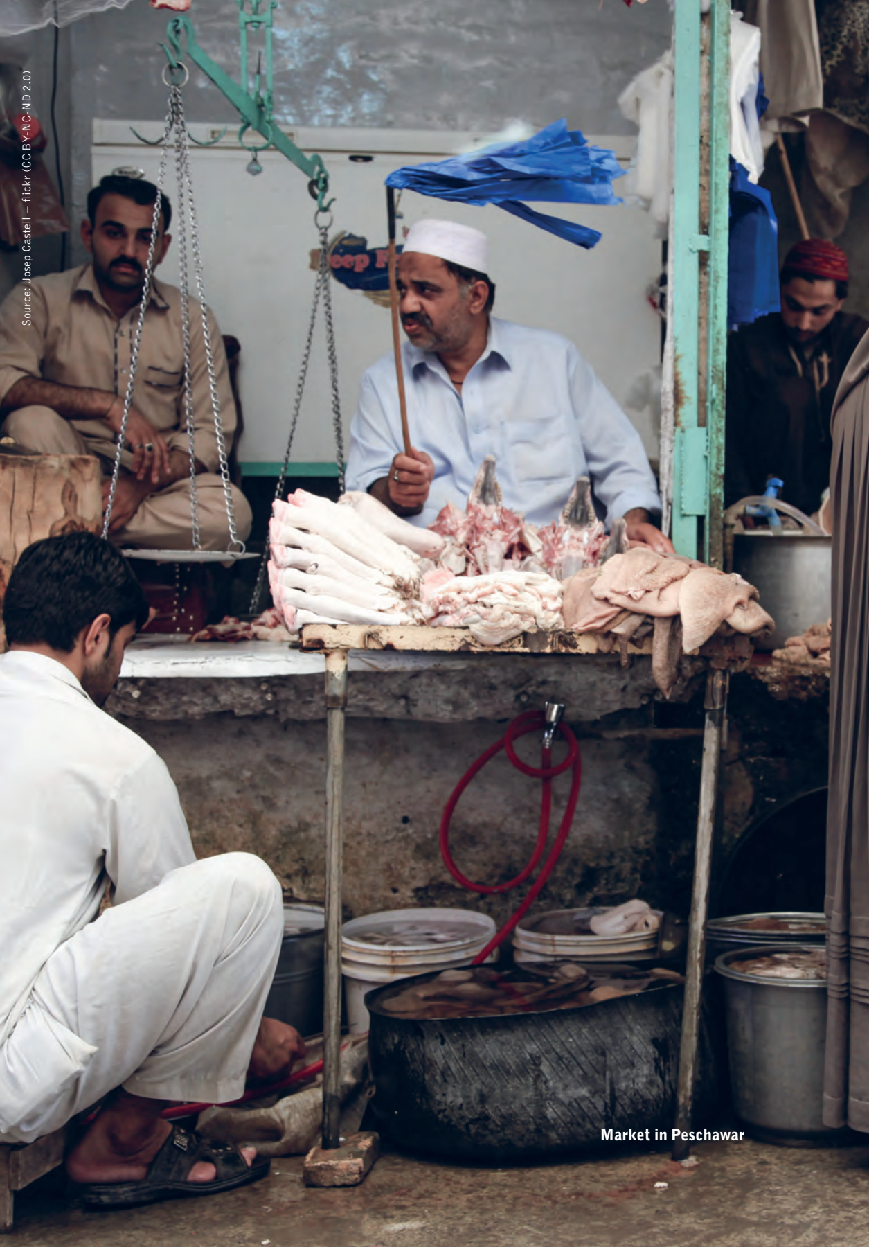
Market in Peshawar