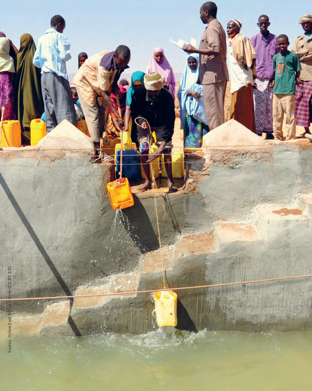
A fresh water basin as the only water source after 11 rainless months