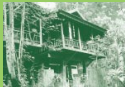
Regional office in Chiang Mai, Thailand