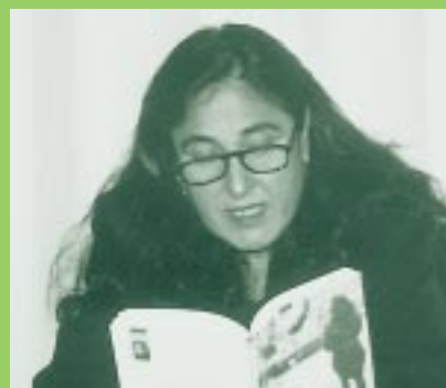
Emine Sevgi Özdamar, writer and actor, Berlin