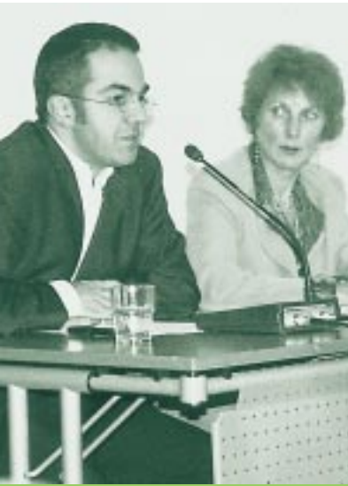
Navid Kermani and Citha Maaß

The magazine www.boell.de , 2001 Two, „After September 11,“ is available from the Foundation (in German).