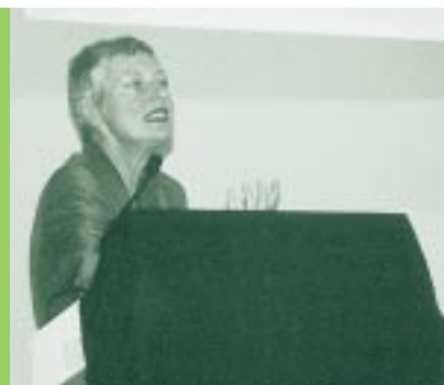
Marieluise Beck, the Federal German government's Commissioner for Foreign Resident Affairs

Democracy in Europe is endangered – this is the conclusion of a report by the Council of Europe, which warns of the increasing influence of right-wing parties and the advance of the skinhead movement. This motivated the Heinrich Böll Foundation to continue its emphasis on „strategies against right-wing extremism“ in its educational activities in 2001. New aspects included the issues of „the new Right“ and „intellectual right-wing extremism.“ Our current activities – intended as both ideological critique and an „immunization of minds“ – posed questions such as: Where do anti-democratic, populist and right-wing conservative thought intersect? How do right-wing extremist ideologies address controversial current issues such as biopolicy, European unification and immigration? Among other activities, the Foundation participated in the project „Multi-colored, not Brown,“ which was part of a German federal government program to promote civil society initiatives against right-wing extremism and xenophobia. This project offers political and cultural education to young people and trainers in the Brandenburg region; its goals are to provide information, to shed light on issues, and to encourage resistance and activism against right-wing ideas and structures.