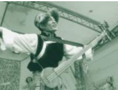
Tibetan artist at the Carnival of Cultures in Berlin

The Tibetan Institute of Performing Arts (TIPA) participated in the June 2001 Carnival of Cultures in Berlin with the performance of a traditional Lhamo (Tibetan Opera). The artists were invited to Germany by the Heinrich Böll Foundation. Since the early 1990s, the Foundation has been providing support to the Tibetan exile community in Dharamsala in northern India for the construction of democratic institutions and the preservation of their cultural and religious identity. Cooperation with TIPA began in 1997 within the scope of the project „Cultural heritage and development for the Tibetan exile community in India.“ The project focuses primarily on reviving and popularizing Lhamo within the exile community, in order to portray topics of sociopolitical relevance in a manner which both educates and entertains the public and simultaneously revives cultural traditions.