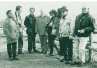
International environmental experts visiting Germany