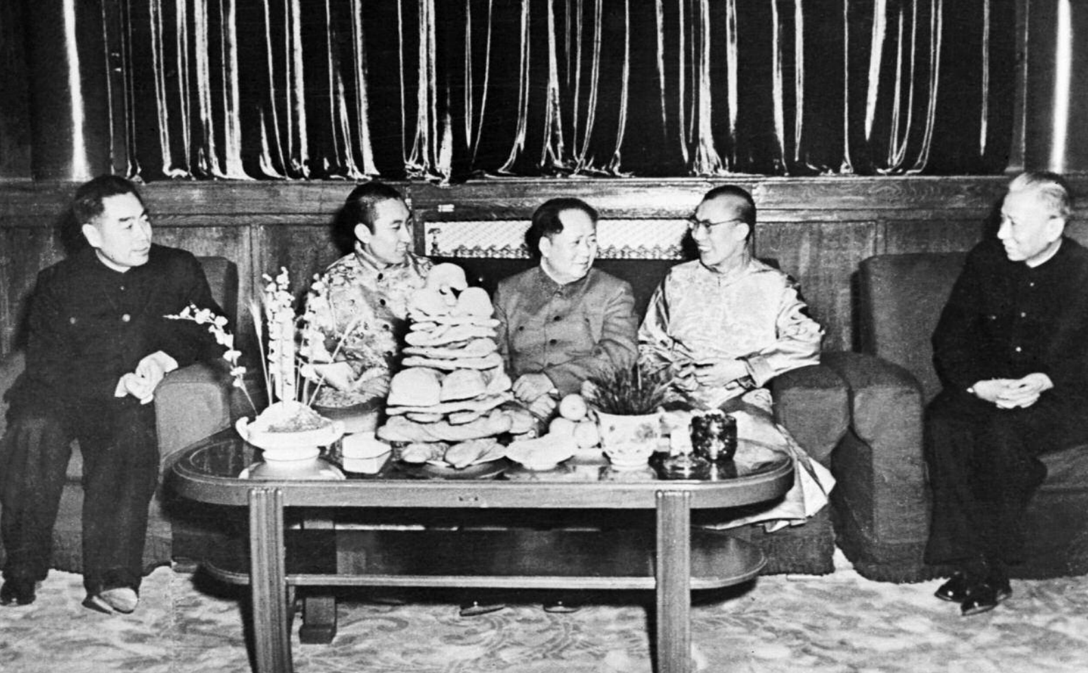
The Panchen Lama (second from left) and the Dalai Lama (second from right) in 1956, by their Communist "protectors", Mao Zedong (Center), Chinese Premier Zhou Enlai (Left) and Liu Shaoqi (Right) in Beijing.

the Ming in charge of Tibetan affairs. But the conspicuous point remains: the edict cited by the Xinhua release is from 1373 and tells of the creation of the Ngari Tribal Military Command at that time , while the Ming shilu records an imperial order to create such an office only in 1375.