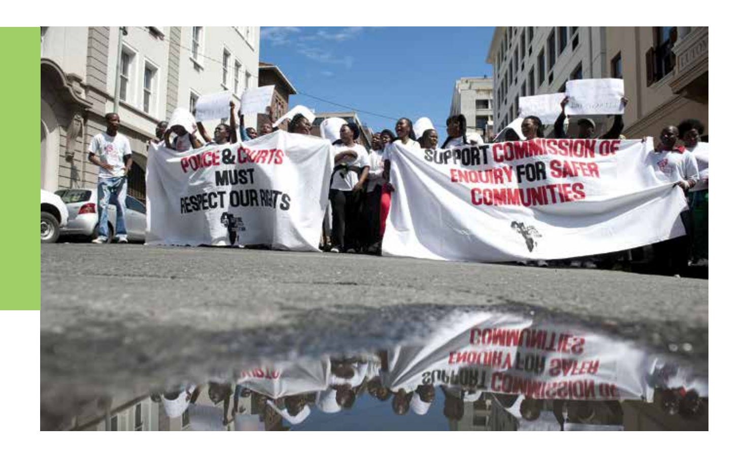
Members of the Social Justice Coalition protest outside the High Court in Cape Town, South Africa.

during the local government elections campaigns in 2016, exposes the high level of intolerance and willingness to use violence against political opponents in our country.