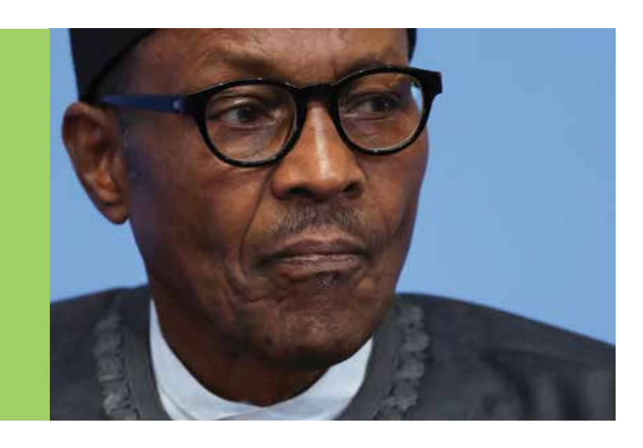
Nigerian President Muhammadu Buhari at an international anticorruption summit in London.

Neither the president nor the ruling party has expressed an opinion on the Bill. Thus, the position of government is unclear at this stage.