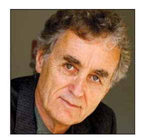
Dr Fritjof Capra

Given the obvious dangers of irretrievably releasing genocidal genes into the natural world, and the moral implications of taking such action, we call for a halt to all proposals for the use of gene drive technologies, but especially in conservation.