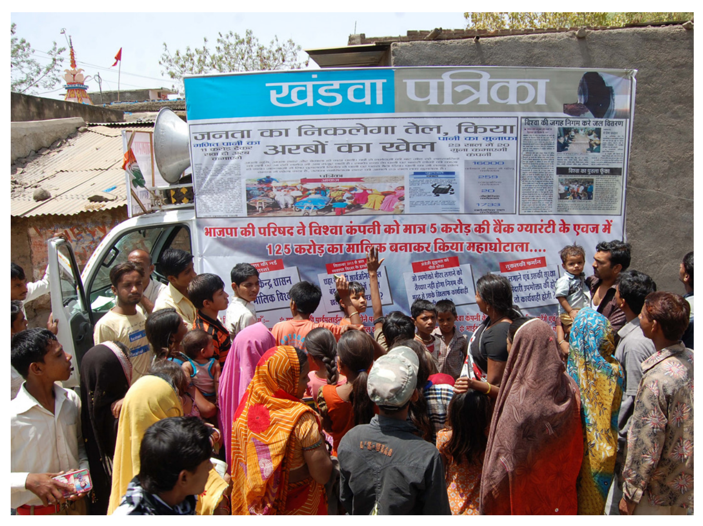
CSOs campaigning about the water supply in Khandwa.

the contract, unemployment in the town was high; 35 per cent of the population was poor and the average per capita income was close to US$380 per year, according to an economic survey of the state in 2009-2010.