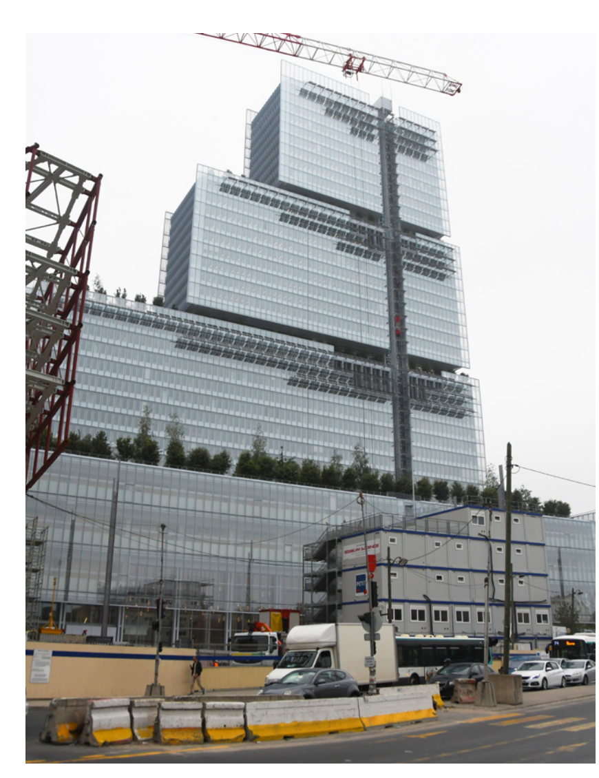
Construction of the Paris courthouse was delayed.

Furthermore, the PPP contract placed an excessive level of risk on the public sector, paving the way for possible additional costs. All of the costs linked to project-related risks beyond the threshold of €2 million would be borne by the public partner,<sup>141</sup> from general strikes and national disasters to legal procedures of appeal against the PPP contract.<sup>142</sup> One of these risks materialised in July 2013 when construction of the PPP was interrupted for eight months, as a result of the fact that the PPP was challenged in the Court by the association "La Justice dans la Cité". This interrupted the construction until the court gave its judgement, and led to a renegotiation of the costs associated with the construction interruption.