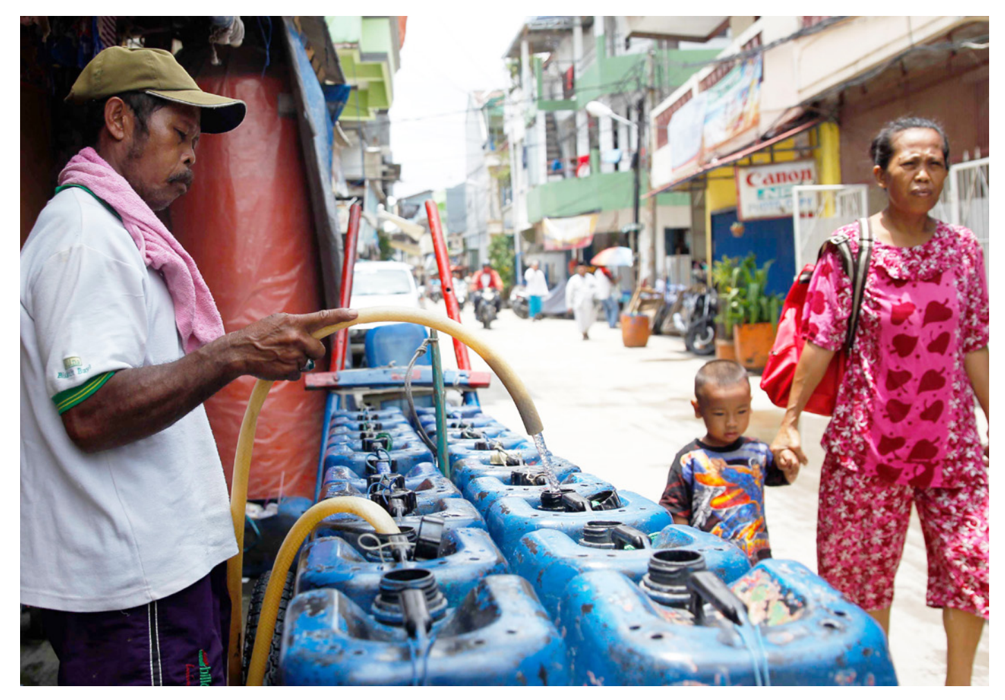
Filling up at a pump station before delivering water to residents in Jakarta's slums.

The PPP contracts established that the assets, including network, treatment plants and equipment, were transferred to the private companies with the agreement that they would be returned by 2023, at the end of the concession. The two private companies took charge of the raw water supply, cleaning the raw water, pipe network and customer service. PAM JAYA remained responsible for setting the tariff applied to consumers. For these services, it pays a "water charge" to the two companies while customers pay "water tariffs" to PAM Jaya.<sup>198</sup>