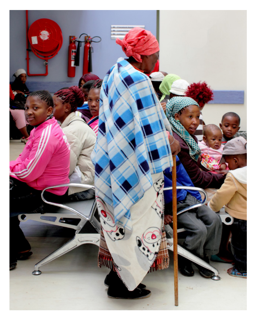
Waiting room at the Queen Mamohato Memorial Hospital, Maseru 2014.

Due to the complexity of the contract and a high number of disputed fees which are still part of an arbitration process, the actual cost of the PPP to the government remains contested and uncertain. Most recently, a 2017 Lesotho public health expenditure review by UNICEF and the WB reinforces concerns about the financial sustainability of the PPP.<sup>112</sup> The review data shows that actual expenditure on the PPP — what government paid rather than what they were invoiced — amounted to 35 per cent of recurrent health expenditure over the four years leading up to 2017, or 30.6 per cent net of Value Added Tax (VAT).<sup>113</sup> It is important to note that total health expenditure has increased dramatically since the PPP baseline year, indicating a concerning rise in the actual cost of the PPP to the government.<sup>114</sup> The review's figures suggest that in 2016 Tsepong's 'invoiced' fees amount to two times the "affordability threshold" set by the Government and the WB at the outset of the PPP.<sup>115</sup> The review claims the PPP expenditure is in line with expectations but goes on to acknowledge that significant additional fees could impact the sustainability of the contract. The figures also reveal a concerning trend of government paying a lower proportion of the invoiced fee each year since 2012/13. 116