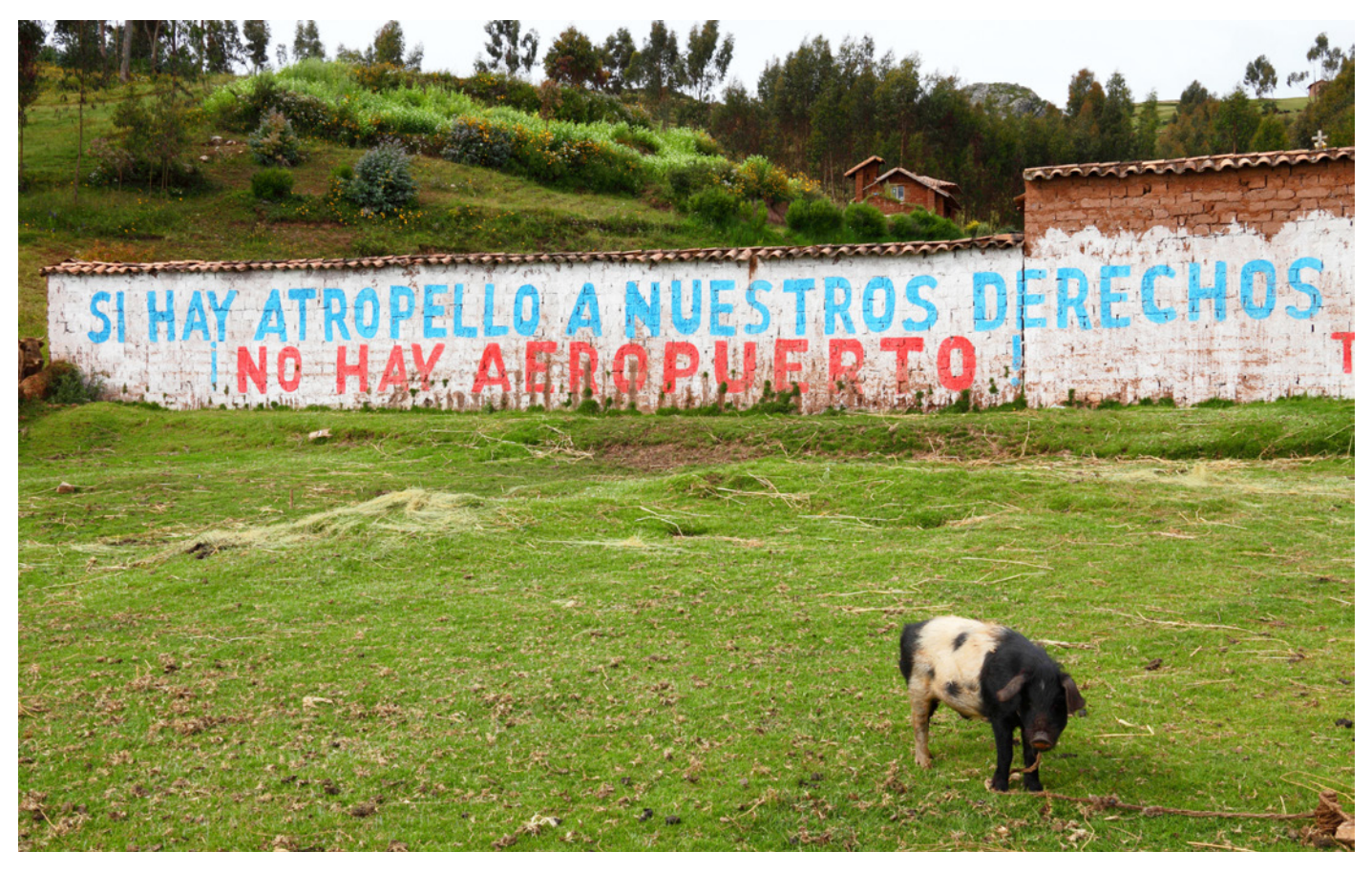
Writing on farm wall protesting against plans to build an international airport near the village of Chinchero (Cusco, Peru).

On that basis, the proposal was rejected for being extremely high, and against the public interest. As the state can borrow at an interest rate of 7 per cent, it was considered that the interest rate that Kuntur Wasi should request could not be higher than 9-10 per cent.<sup>158</sup>