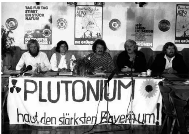
Press conference of the parliamentary group against the nuclear re-processing plant in Wackersdorf in 1985

Please note that the archive often does not hold the copyright to the images.