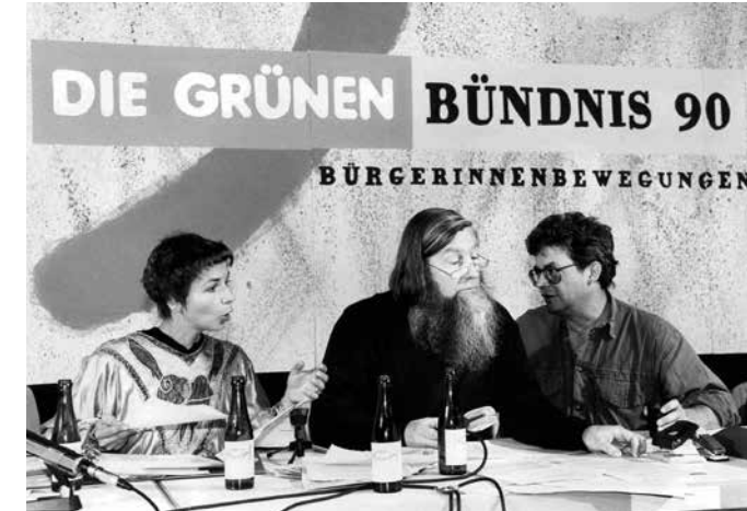
Meeting of the federal delegates' conference in Bayreuth, 1990

The campaign office for the 1979 European elections was the seed of today's national headquarters of Alliance 90/The Greens, and the systematic documentation of the Greens in the Green Memory Archive begins there. In 1982, the Greens significantly expanded their headquarters in the run-up to the 1983 federal election. The core documents are the files of the federal executive committee, the federal delegates' conferences and the federal general committee of the party, files related to the environmental, peace and anti-nuclear movement, correspondence and press releases as well as the member administration of the years 1979 to 1982. The documents from the early days provide important insights into the founding Green generation and the party's role in the environmental, peace and anti-nuclear movements.